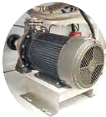
High Pressure/High Volume Stainless Steel Pump in Wash.