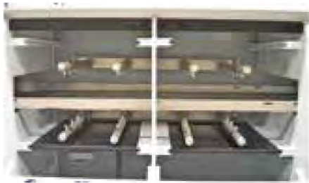
Typical Recirculating Spray Layout.